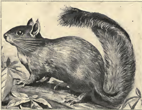
FIG. XXVI. SCIURUS AUREIGASTER . GOLDEN-BELLIED SQUIRREL.